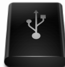
USB Plug & Play